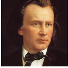
Symphony No. 1 in C Minor, Op. 68 JOHANNES BRAHMS (1833-1897)