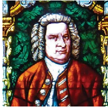
Selections from Christmas Oratorio , BWV 248 JOHANN SEBASTIAN BACH (1685-1750)