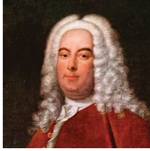
Selections from Messiah GEORGE FRIDERIC HANDEL (1685-1759)